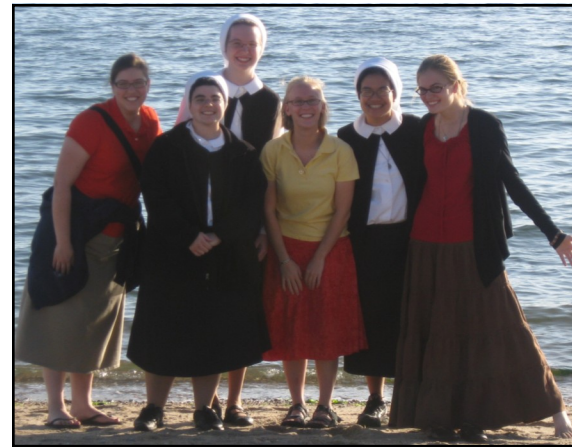
Prepostulants and novices enjoy a warm September day on the beach.

One of the highlights of living at our provincial house is being close to our retired sisters. Sacred Heart Manor is truly a powerhouse of prayer. The 30+ sisters in residence are always willing to share a story and a smile as we visit and get to know them as a treasured part of our history. We enjoy spending holidays and other special events with them. They were gracious enough to host this year's Halloween Party. Another advantage to living at the Mount is the presence of the Novitiate community. Being with other women in formation not only helps us build community but also allows us to form friendships and share adventures together. This year we were fortunate enough to travel to Washington, D.C. for a Eucharistic Congress in September and will attend a Spirituality Convocation at St. Elizabeth College in New Jersey in April.